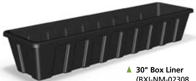
▲ 30" Box Liner (BXI-NM-02308, windowbox.com)